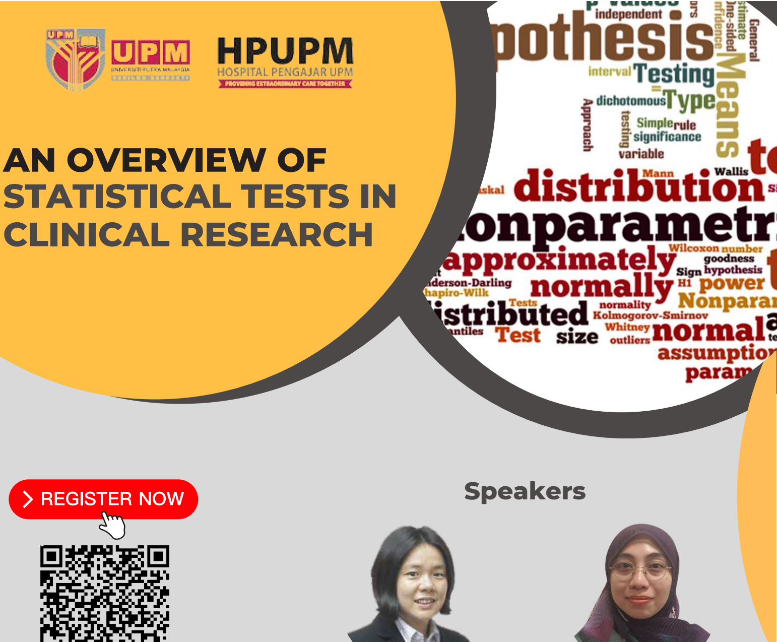
Registration Link: shorturl.at/fGUV2